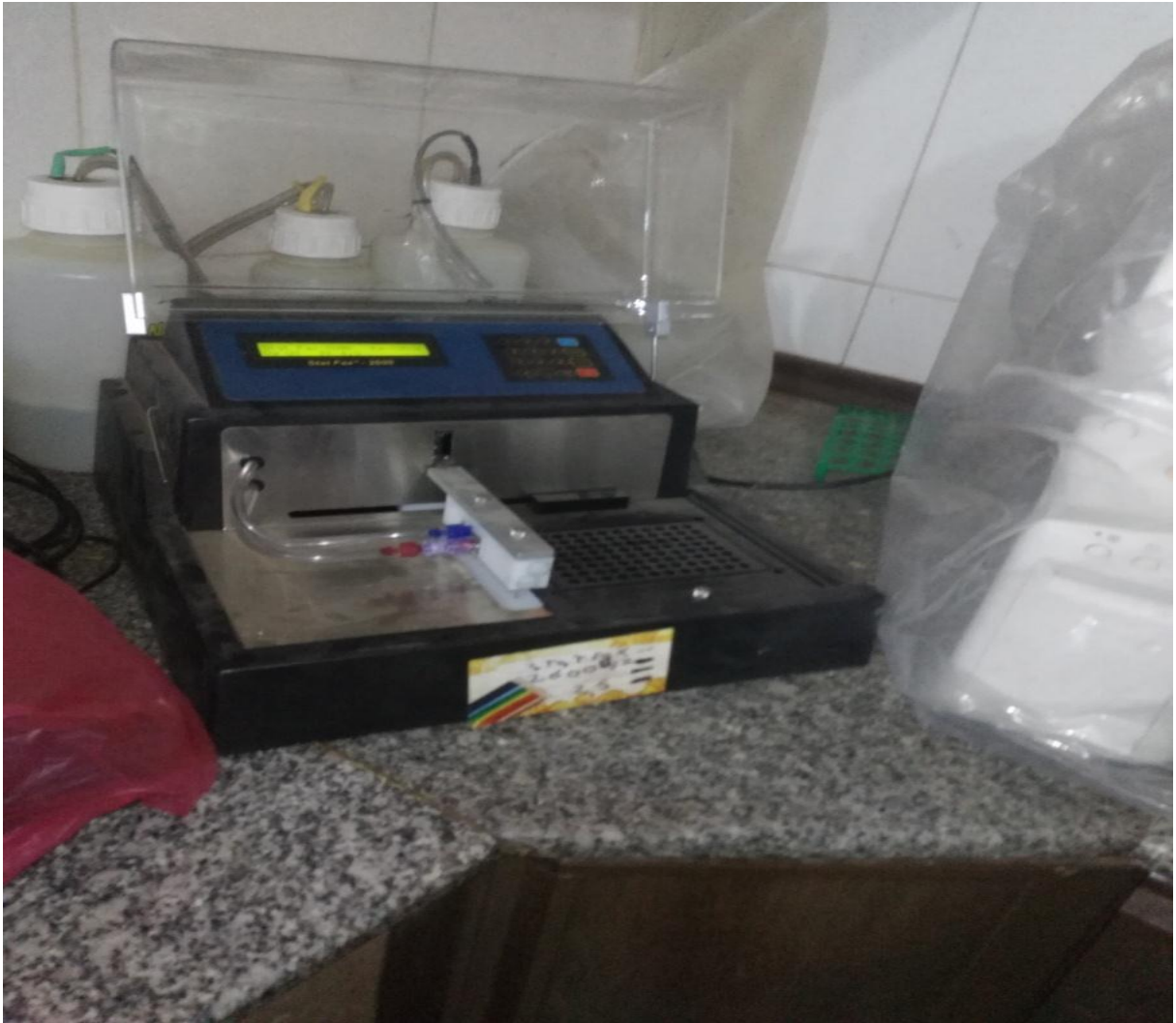
ELISA washer apparatus