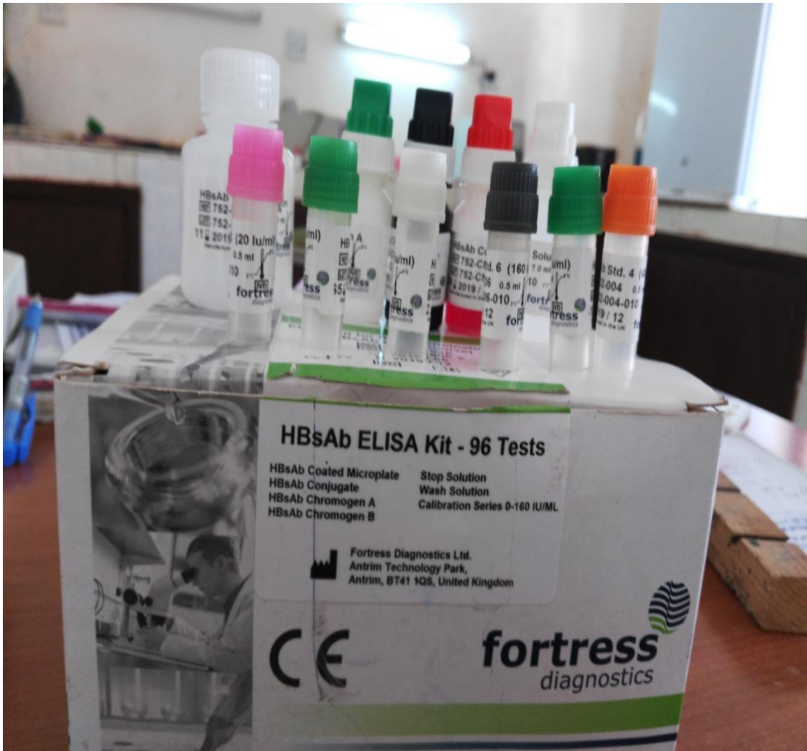
Fortress diagnostics HBsAb ELISA kit