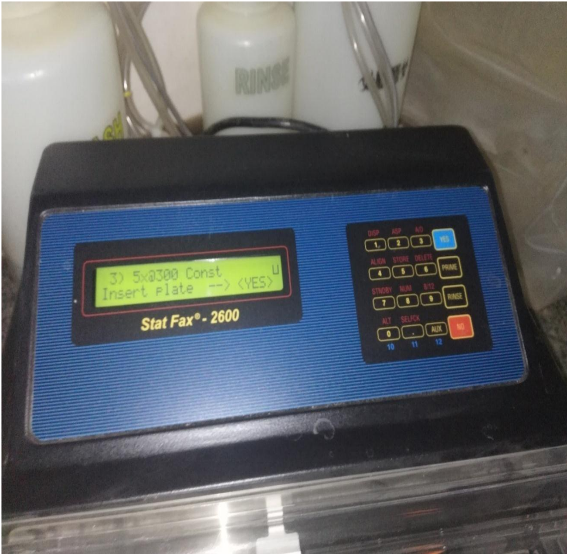
ELISA reader apparatus