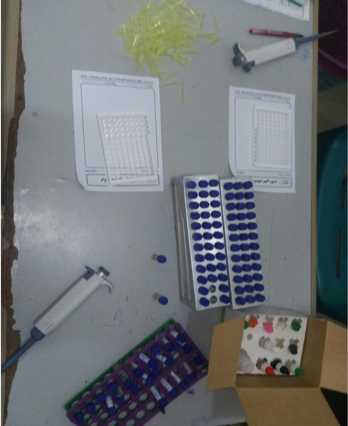
ELISA kit components