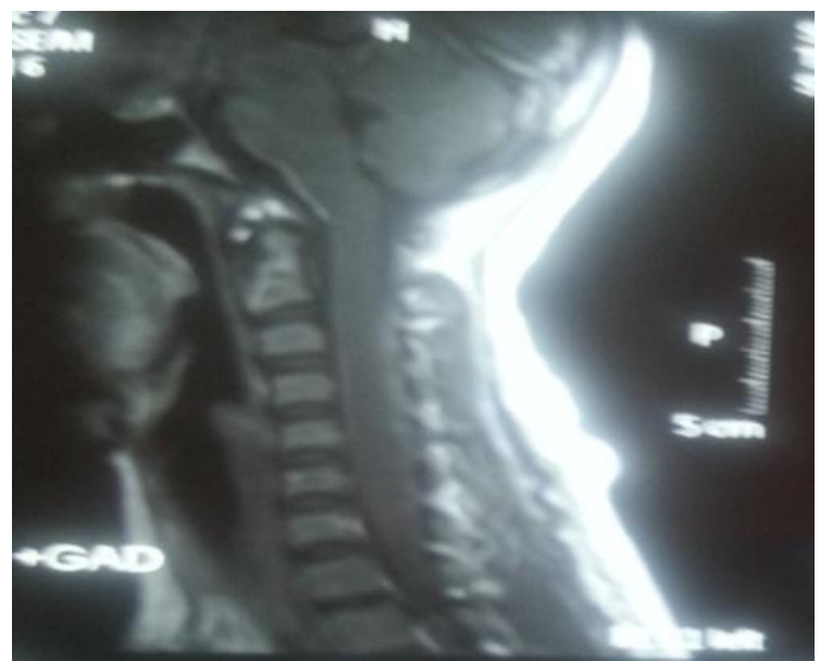
CT-spinal angiogram: Revealed: cervical spine dural arterio-venous fistula figure. [2]